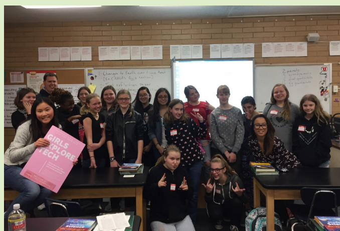
More than 20 girls participated in Taylor's after school program.

I tried to make GET the most accessible it could be, using factors addressed in the NCWIT infographic,